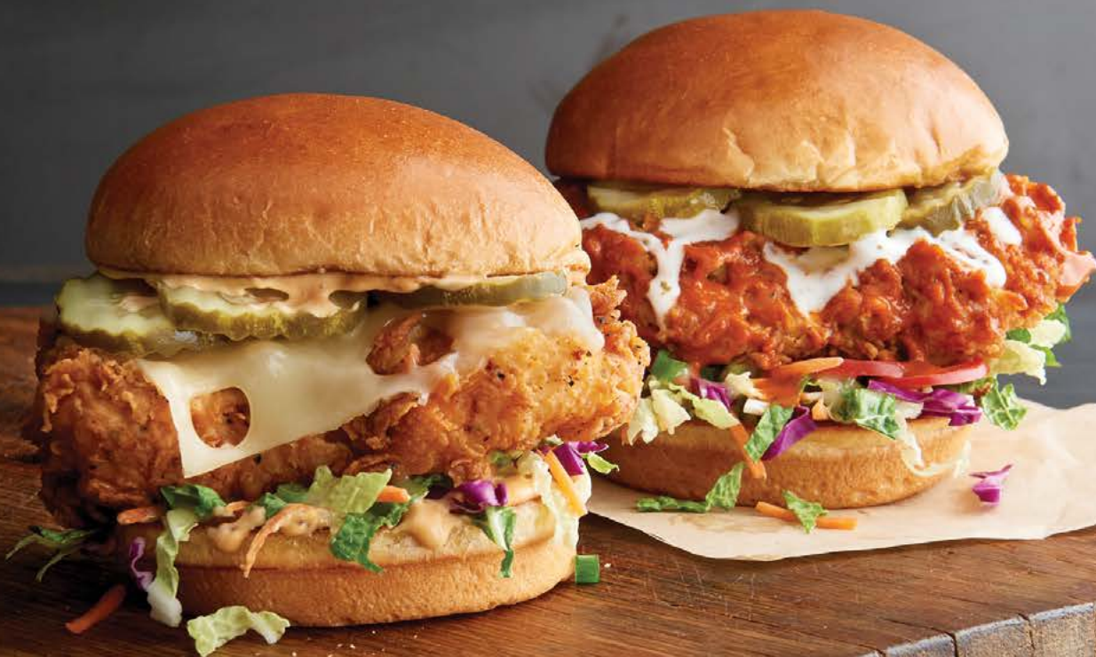
Hand-battered southern chicken sandwich and Nashville hot chicken sandwich

And your lucky recipient can enjoy hand-battered southern or Nashville hot chicken sandwiches from Buffalo Wild Wings®.